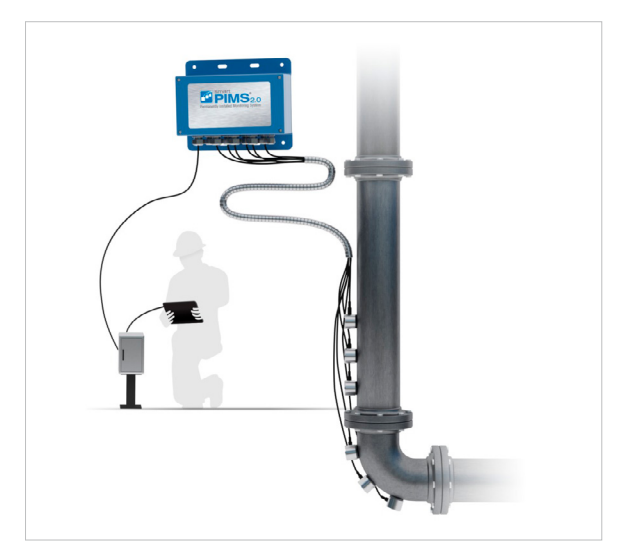
\begin{tabular}{ll} Figure 2: User connecting to smartPIMS Datalogger via DIU adapter and table/PC using dataPIMS software. \end{tabular}