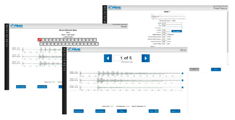
Figure 4: Screenshot of dataPIMS software where thickness, temperature, and other data is stored.

Eddyfi dataPIMS software connects to the smartPIMS instrument and provides users the ability to commission the system for accurate ultrasonic thickness measurements, setting shot time intervals and system hierarchy naming as shown in Figure 4 . dataPIMS also includes basic data management capabilities for Modbus and Datalogger smartPIMS units with storing of thickness data in XML or common CSV file format for easy use in MS-Excel software.