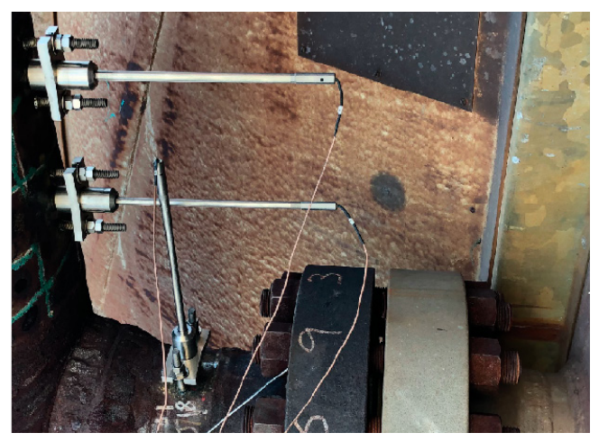
Figure 8: Ultra-High-Temp UT Sensors attached with stud welded clamp.