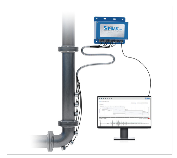
Figure 1: smartPIMS 2.0 connected via Modbus (RS-485) to table/PC or SCADA/DCS.