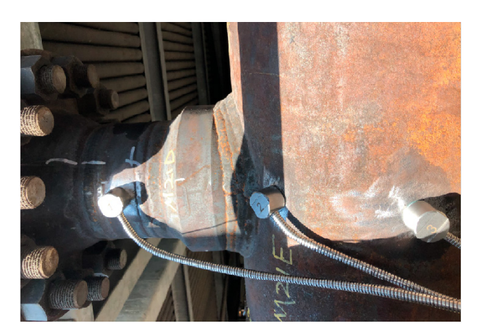
\textbf{Figure 9:} \ \, \textbf{Dual-Element UT sensors with optional SS cable jacket}.