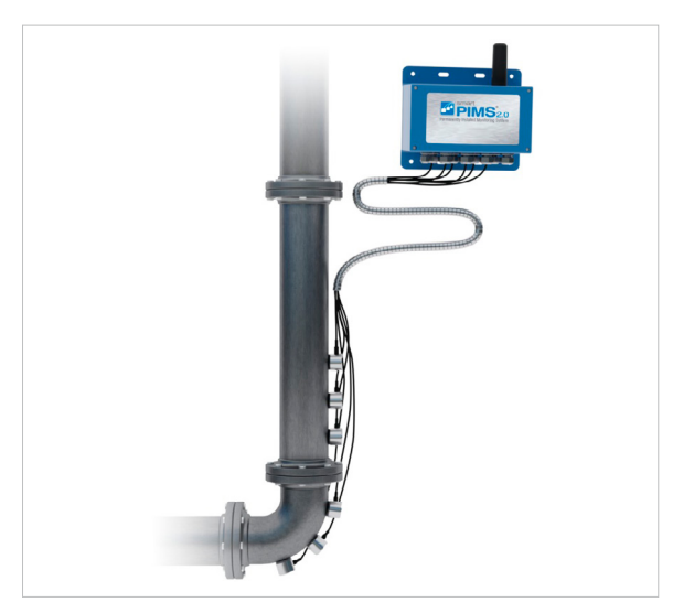
\textbf{Figure 3:} \ \text{smartPIMS 2.0 Cellullar transmits data directly to web PIMS.}