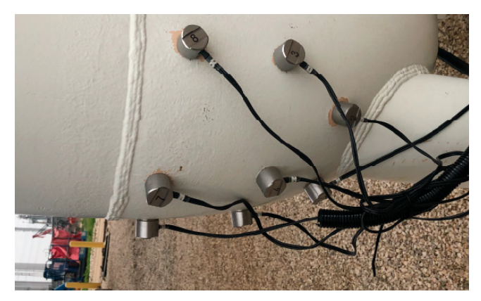
Figure 5: Dual element UT sensors